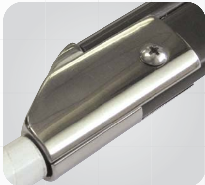
No snag, 2-piece S.S. captive feeder will not peel off