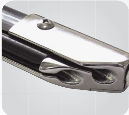
Twin grooves allow for easy sail changes

Stainless steel, snag-free feeder allows spinnaker sheets to pass freely