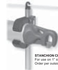
STANCHION CHOCK For use on 1" standard stanchion. Order per outside pole dia.

The pole should be kept level at all times. To accomplish this there will need to be multiple or adjustable mast attachment fittings (track & cars) on the mast except for small day-sailors with a single jib inventory.